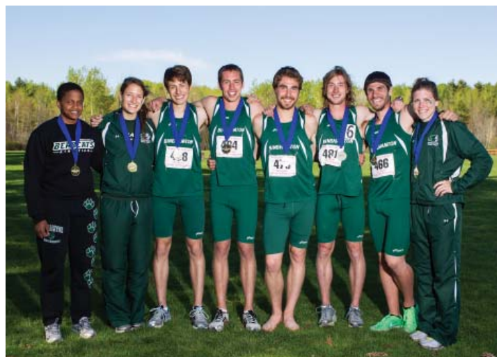
Binghamton won five individual titles and a relay event at the 2012 America East Outdoor Championships