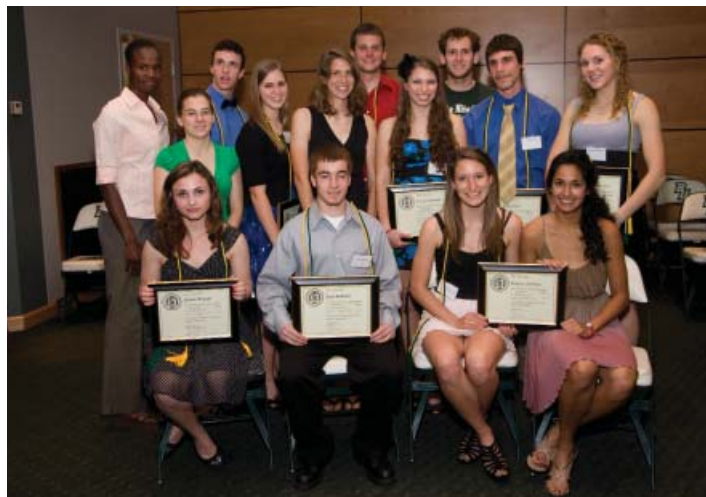
Members of the track & field program at the 2010 National College Athlete Honor Society Inductions

PLEASE NOTE: The ECAC Merit Medalis are awarded to those student-athletes with the 5-10 highest cumulative GPAs within the Binghamton athletic deparment